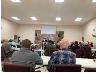
CREAA Staff attends ACRM training March 16, 2023 at Heritage Christian Center in Hueytown, Alabama