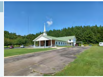
The Bryan Clay House