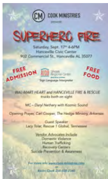
CREAA Attends Superhero Fire for Cook Ministries

“CREAA, the hands and feet of Jesus, to further the Kingdom